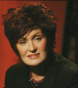
SHARON OSBOURNE BATTLES CANCER