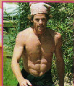
MEET THE GROOM