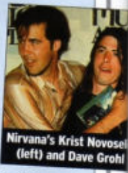
Nirvana's Krist Novosel (left) and Dave Grohl

It's a good thing Hole broke up, since Courtney Love , 38, seems too busy fighting lawsuits to make it to band practice. Besides her ongoing battle with the surviving members of Nirvana (inset), Love is now embroiled in two other legal conflicts. The first involves a Beverly Hills home she rented in 2001. The owners say that the singer "left behind a trail of damage" and stuffed "feminine hygiene or other products into a toilet," causing a flood. ick! They are seeking $50,000. The Malama Salon & Spa in Hawaii also has a beef with Love and is suing the star for refusing to pay her bill after allegedly hiring 15 spa employees to do overnight beauty duty. "We got this guy to come in and give us two massages," said Love. "They charged us $15,000 for it. Have you ever paid $15,000 for massage? I haven't." LC