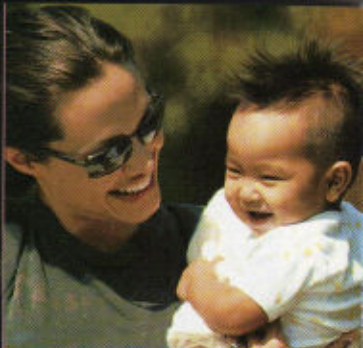
ANGELINA JOLIE: LIFE WITHOUT BILLY BOB