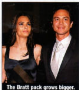
The Bratt pack grows bigger.