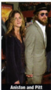
Aniston and Pitt

Ben Affleck and newly solo Jennifer Lopez were seen trotting around New York's trendy